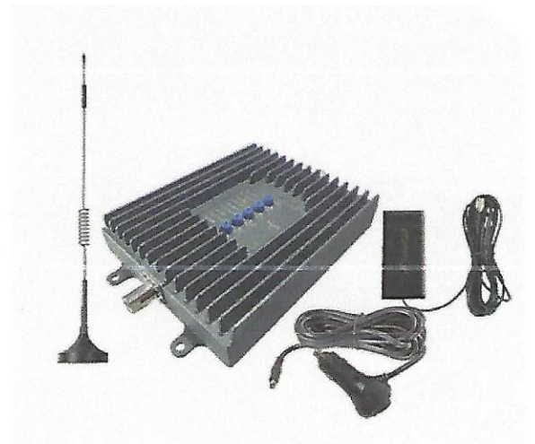
The SureCall Fusion2Go kit